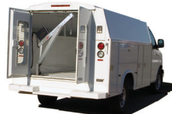
Enclosed Service Bodies