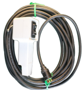
Pendant Controller *