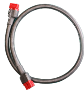
Quick Connect *