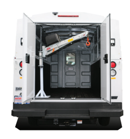
OPTION 3 - ESB - P30 Includes: 3-ft. fold-down crane, pedestal, reinforcement kit