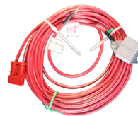
DC Wiring Harness