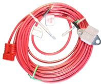
DC Wiring Harness *